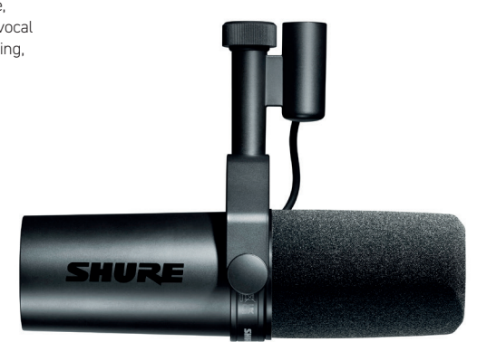
SM7dB Dynamic vocal microphone with built-in preamp