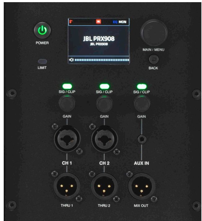
REAR PANEL CONNECTIONS

The JBL PRX908 , part of the PRX900 Series of powered loudspeakers and subwoofers, takes professional portable PA performance to a new level with advanced acoustics, comprehensive DSP, unrivaled power performance and durability, and complete BLE control via the JBL Pro Connect app.