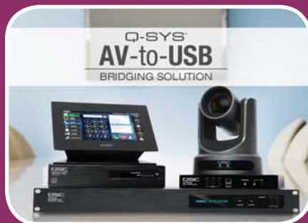
Five Ways QSC's Q-SYS Is Ideal For IT