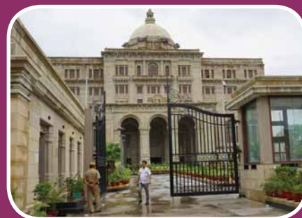
UP Lok Bhavan: A Revelation Of Stately AV Deployment