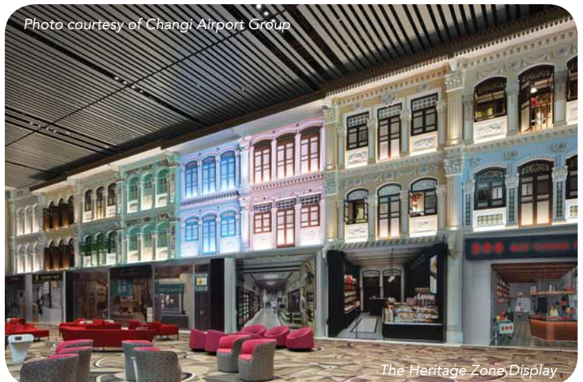
The Heritage Zone Display