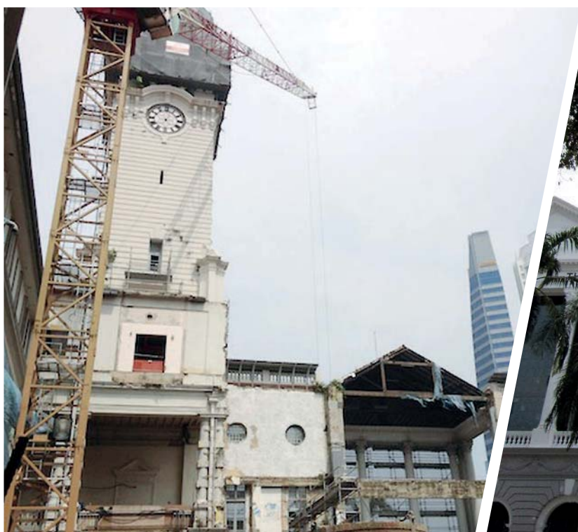
During the renovation