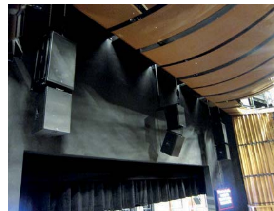
The theatre's main Meyer Sound FOH system