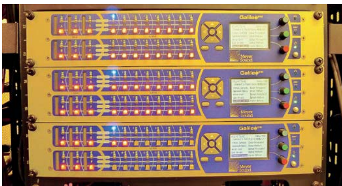
The three Meyer Sound Galileo processors