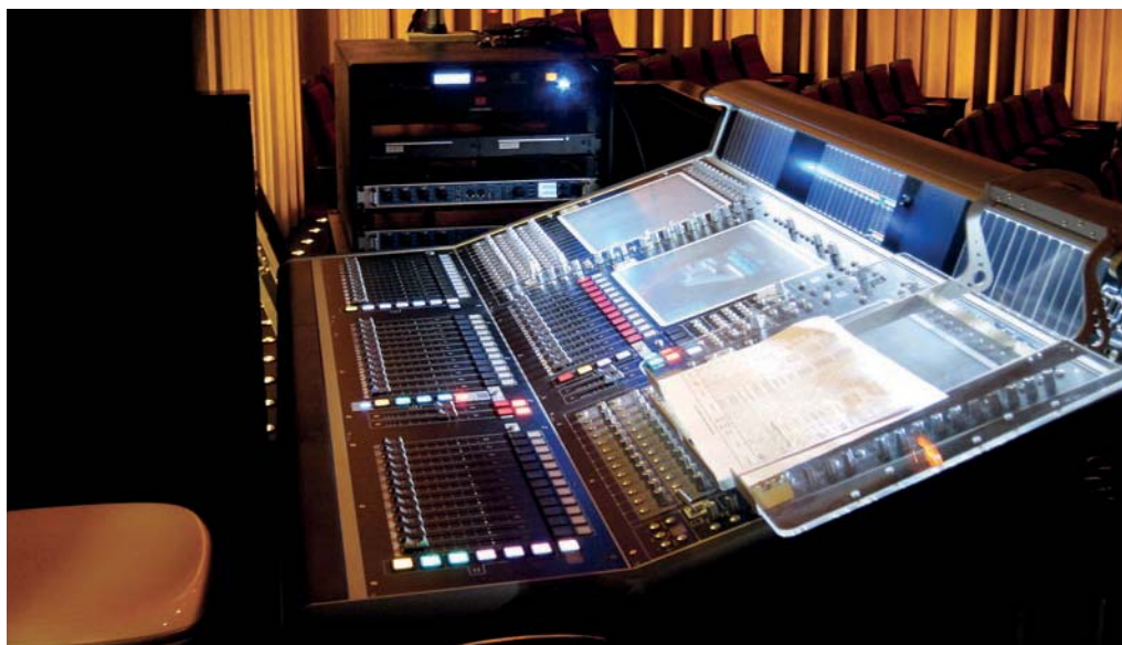
A DiGiCo SD7T is installed for front of house mixing inside the theatre

The front of house position sits at the rear of the under-balcony area, housing a DiGiCo SD7T linked to two DiGiRacks located in the basement and stage area. Above it is a recessed control room with an open window onto the auditorium. It is the home of lighting and video – the house lights are ETC Paradigm while