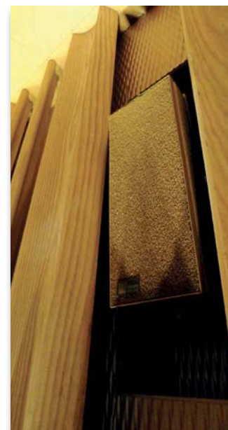
A total of 28 UPM-1P cabinets form the theatre's surround system, each painted gold to match the interior