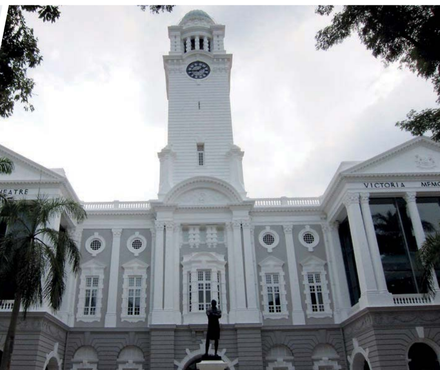
A Singaporean icon – the Victoria Theatre and Concert Hall has now been completed