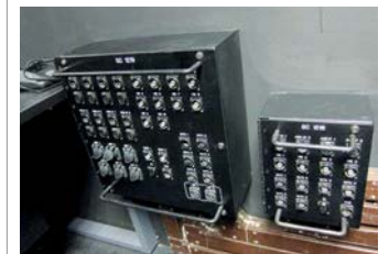
Facility panels are located throughout the site

In terms of background technology, much of the same design as applied to the Theatre has been repeated within the Concert Hall. Clear-Com HelixNet is again used for intercom, a further two Q-Sys Core 500i processors manage show relay, Sennheiser provides assistive listening, and a DiGiCo SD9 with a single DiGiRack is used for front of house mixing. Nine sets (18 channels) of Shure UR4D wireless with corresponding numbers of UR2/KSM9B and UR1 with countryman earsets are available.