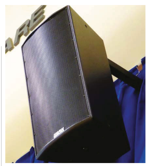
One of the MK2396i cabinets suspended in a L-C-R configuration as the main FOH system

Following an official handing over of the sound system service on 27 February, Mr Goh was honoured with a plaque on the frontal wall of the hall. 'Already, the students have benefitted greatly with such a good sound system – they can now appreciate good quality audio,' confirms Ms Rasidah. 'We