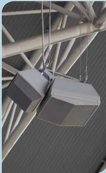
The VIP and lowest tier areas feature EAW MQX speakers that offer two driver and two horns aimed at different angles.

The Event Sound System consists of 35 units of EAW QX 2,000 watt 3-Way Full range speakers installed across the dome roof. There is a mix of QX speakers offering different distribution angles for optimum coverage. In addition to the QX speakers, 6 units of EAW MQX 4,000 watt dual driver/horn speakers were installed serving the lowest section of the grand stand and VIP area. Generally unusual in a stadium installation but 48 units of EAW SB528ZP-WP-W 2,000 watt Dual 18" Subwoofers were also installed below the dome roof. The Subwoofers were configured into 12 clusters of 4 speakers each, 2 units stack 600mm above another 2 units all facing down for a cardioid distribution pattern; that is with all the sub bass energy aiming downwards towards the seating galleries and not upwards and avoiding the roof. The 12 units of cardioid subwoofer clusters are evenly spaced over the seating galleries.