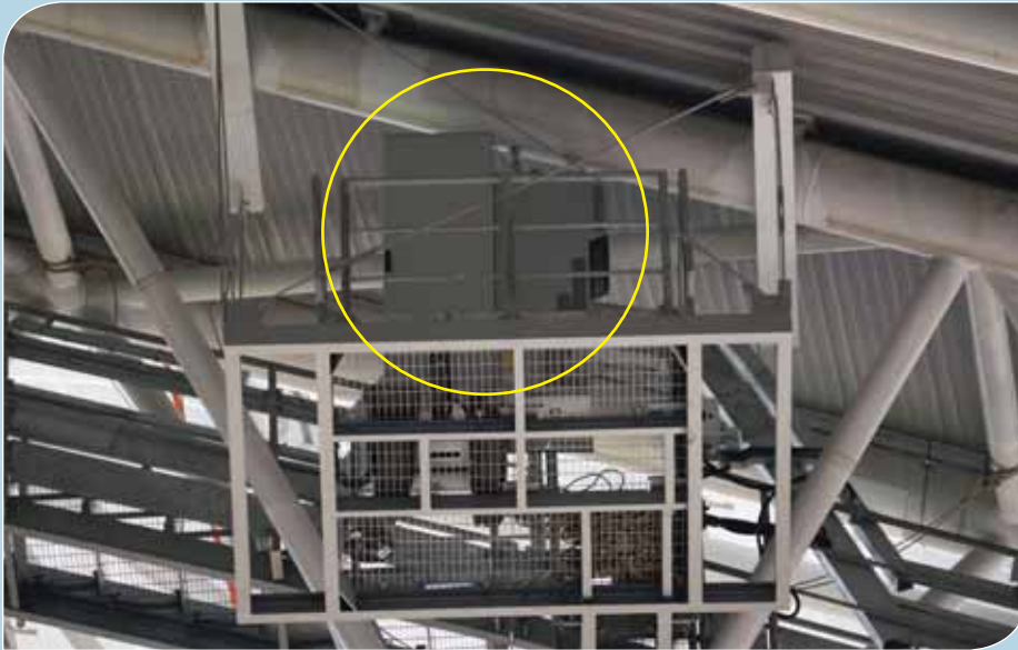
The sealed air-conditioned rack housing the amplifiers, DSP and NETGEAR switch.

All the EAW speakers are weather proofed models painted over with fiberglass resins and painted in light grey to blend in with the roof trusses.