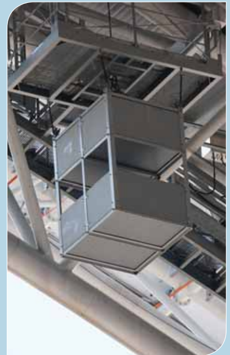
The Subwoofers were configured into 12 clusters of 4 speakers each, 2 units stack 600mm above another 2 units all facing down for a cardioid distribution pattern