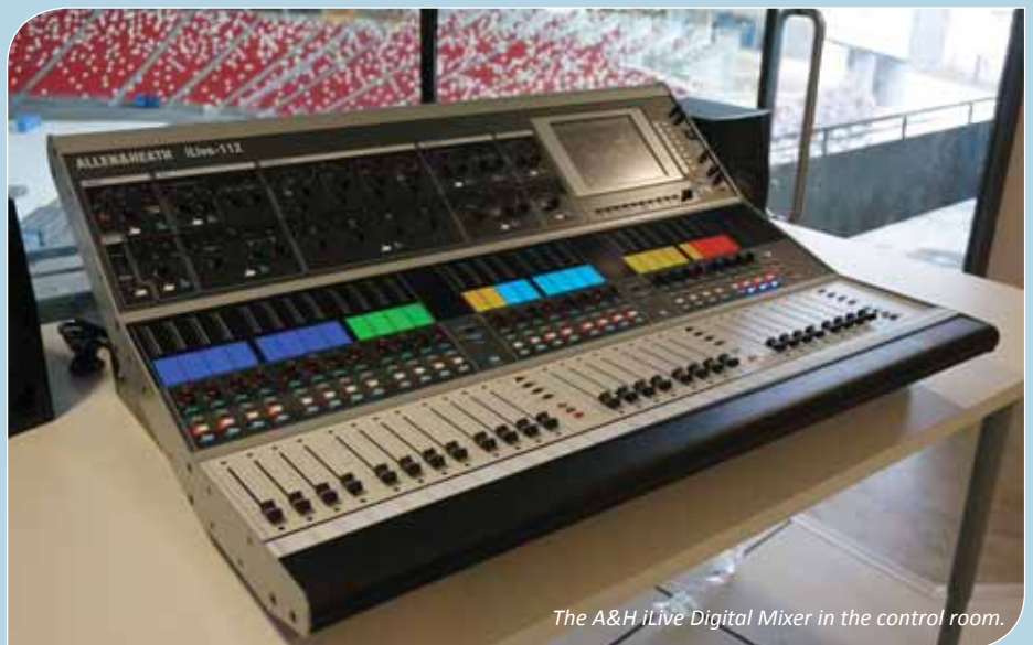
The A&H iLive Digital Mixer in the control room.