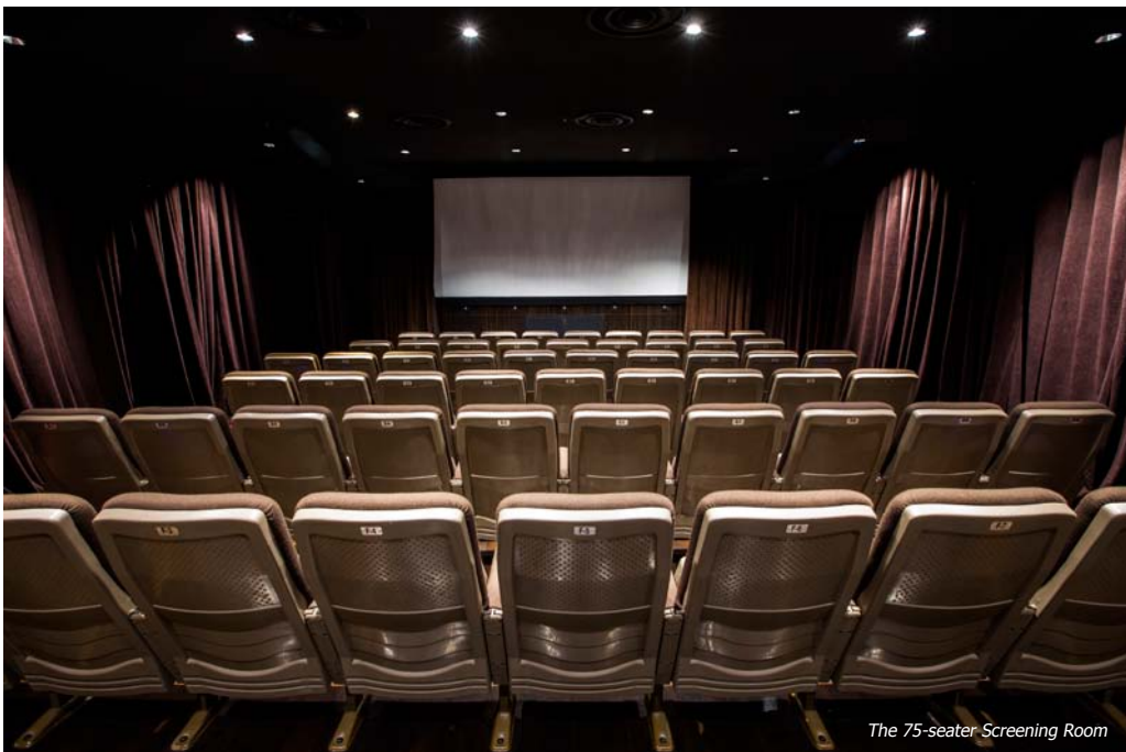
The 75-seater Screening Room

E&E supplies and installs systems for the upgrade