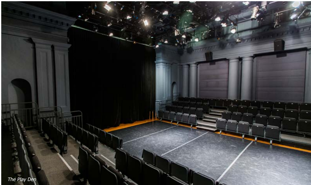
The Play Den