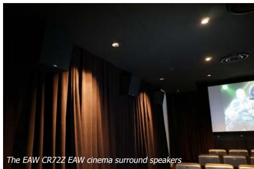
The EAW CR7ZZ EAW cinema surround speakers

The 75-seater Screening Room was given a face-lift to meet the needs of an intimate cinema hall setting. DCP-certified