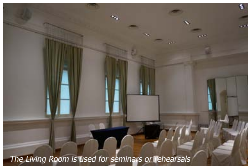
The Living Room is used for seminars or rehearsals

The Living Room is usually used for seminars or rehearsals. This room features four units of EAW SMS4990 2-way full range loudspeakers that are installed on the left and right of the main elongated wall, with a speaker each on both the side walls. Two units of Ashly power amplifiers and an Ashly DSP speaker processor are used with a Mackie 12 channel mixing console. The equipment rack is permanently placed within the space.