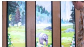
DECEMBER 17, 2019 0

DOOH Campaign Alerts Drivers to Headlight Malfunction